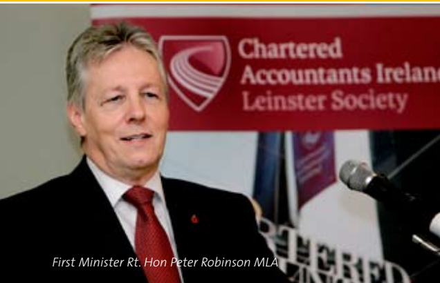
First Minister Rt. Hon Peter Robinson MLA

I know you have been going through some very difficult times recently but just consider the massive advantages you have today when compared with the early 1980s. This time you have in place the massive investment you've made in infrastructure which will pay huge dividends in the long term.